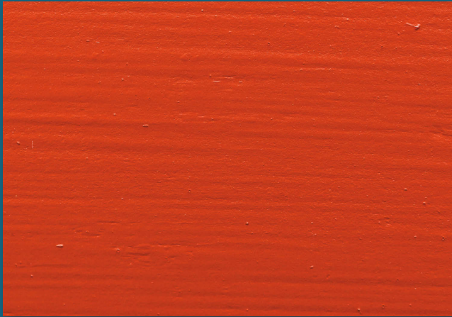
A leading national competitor